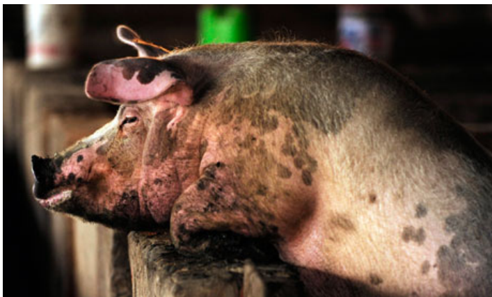
Pigs are 'more omnivorous than other farm animals', but the case is still highly unusual, an animal behaviour expert says.