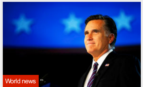
Mitt Romney lost because hardline Republicans betrayed him